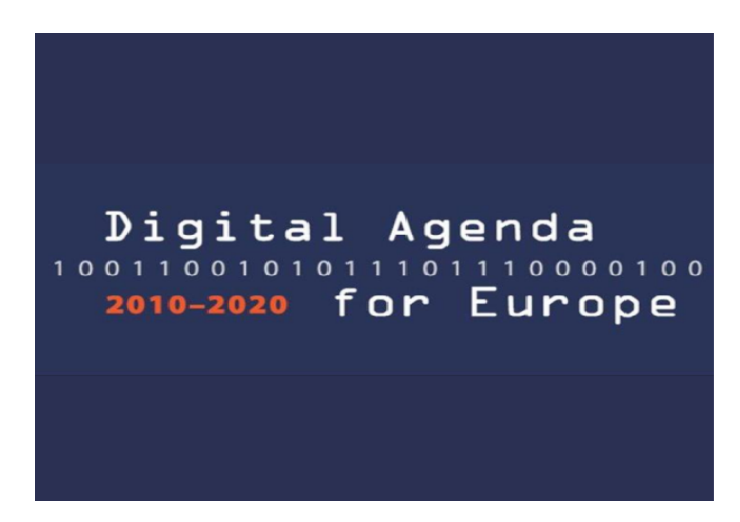
Figure 2.The "Digital Agenda for Europe" logo

In 2010 as a natural follow-up to the "i2010" initiative, the European Commission launched the "Digital Agenda for Europe - i2020" "Figure 2" – a plan for the EU's online environment for the next decade: 2010-2020. The Digital Agenda is Europe's strategy for a flourishing digital economy by 2020. It outlines policies and actions in order to maximize the benefit of the digital revolution for all of Europe's citizens.