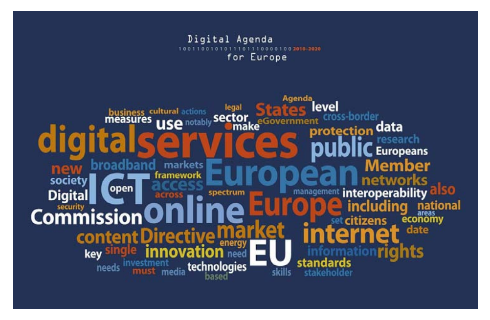
Figure 3. A graphic rendering of the seven pillars of the "Digital Agenda for Europe"

As the end of 2012 marked one of the most important European community's anniversaries - the 20<sup>th</sup> anniversary of the European Single Market – it is quite critical to stress the fact that an active Digital Single Market will strengthen the European Single Market and benefit society as a whole.