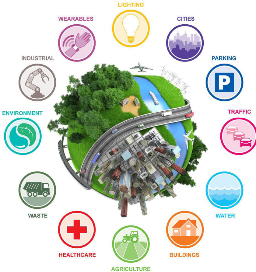
Figure 1. An overview of Smart City ( www.iotnet.eu/wp/solutions/ )